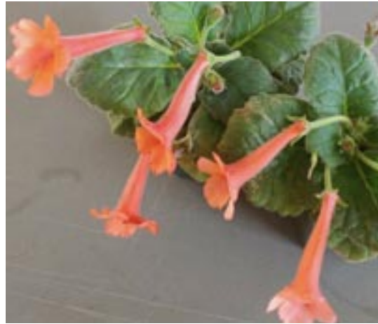
Mini Sinningia