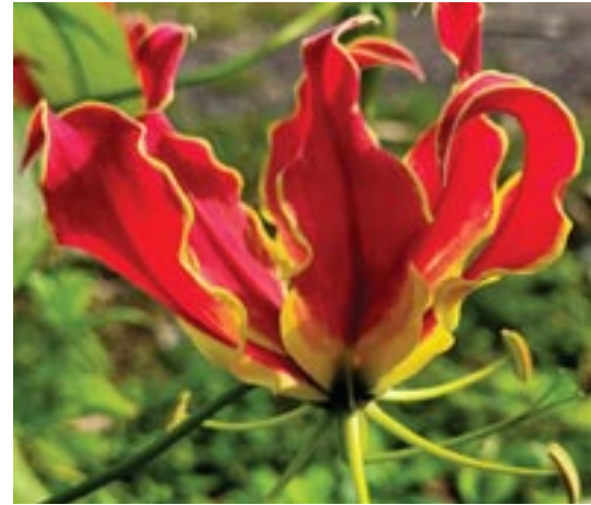
Gloriosa Lily, photo courtesy of Brent & Becky's

These red to purple-black 3–4" berries are popular throughout the Middle East and Central Asia. Sweet-tart taste like raspberries or blackberries but a bit citrusy. Fast-growing and self-fruitful, the tree will produce summer fruits in a couple years when over-wintered indoors. Shiny, heart-shaped 6" leaves. Also known as Himalayan black mulberry, Tibetan mulberry, and long mulberry. 6–8" h ○ $24.00—5.25" pot