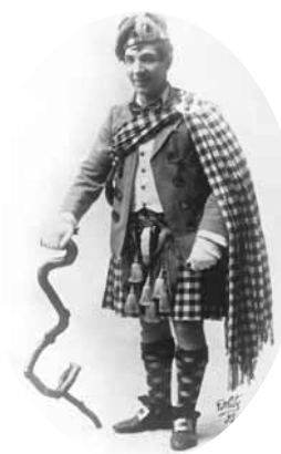
Harry Lauder with his walking stick.